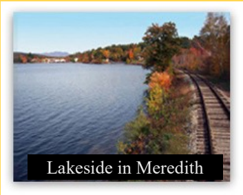
Lakeside in Meredith

Enjoy a traditional turkey dinner aboard the Hobo Railroad, catered by renowned Hart's Turkey Farm! Your round-trip Fall Foliage Dinner Train departs Meredith Station and travels south along the western shore of Lake Winnepesaukee through the village of Weirs Beach and along Paugus Bay towards Lakeport, NH before returning along the very same route. Along the way you'll enjoy breathtaking views of New Hampshire's largest lake while sneaking a peek at some of the many beautiful lakeside homes you'll pass along the way.